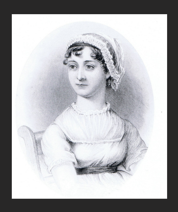
Jane Austen (1775–1817)

Across both destinations, indulge in tranquil landscapes, elegant comfort, and the enduring romance of Austen's legacy.